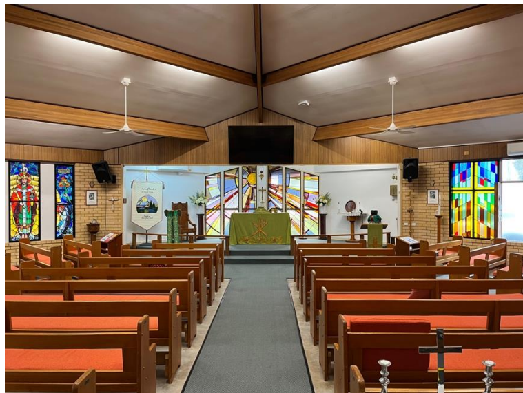
Church interior from choir section

The church complex includes the main church, an entry lobby and chapel, sacristy, priest's office, parish office, meeting room, fully equipped modern kitchen, and hall. The extensions to the church were completed in 2020.