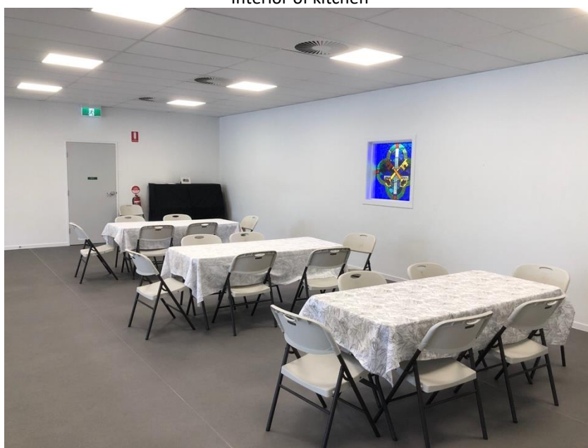
Partial view of Parish Hall