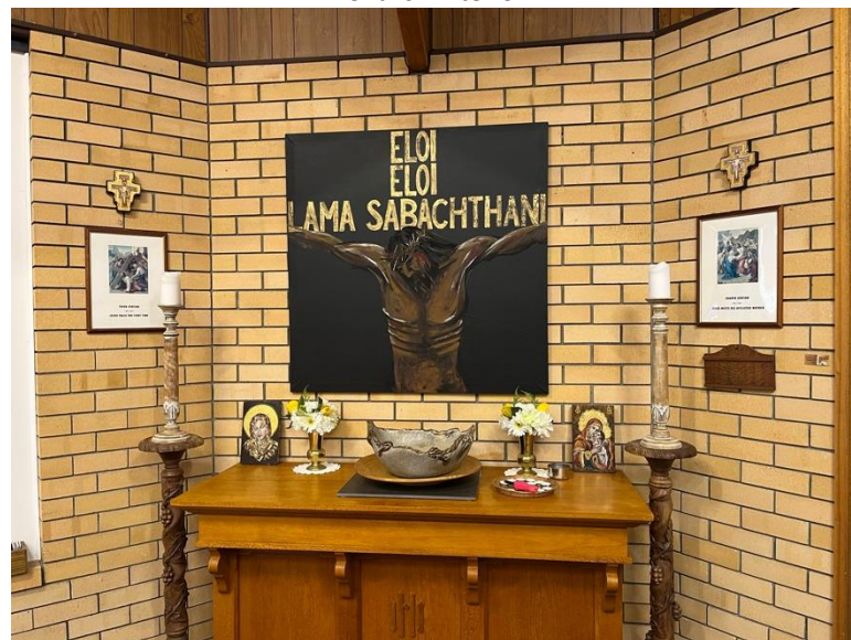
Side altar and votive candle bowl