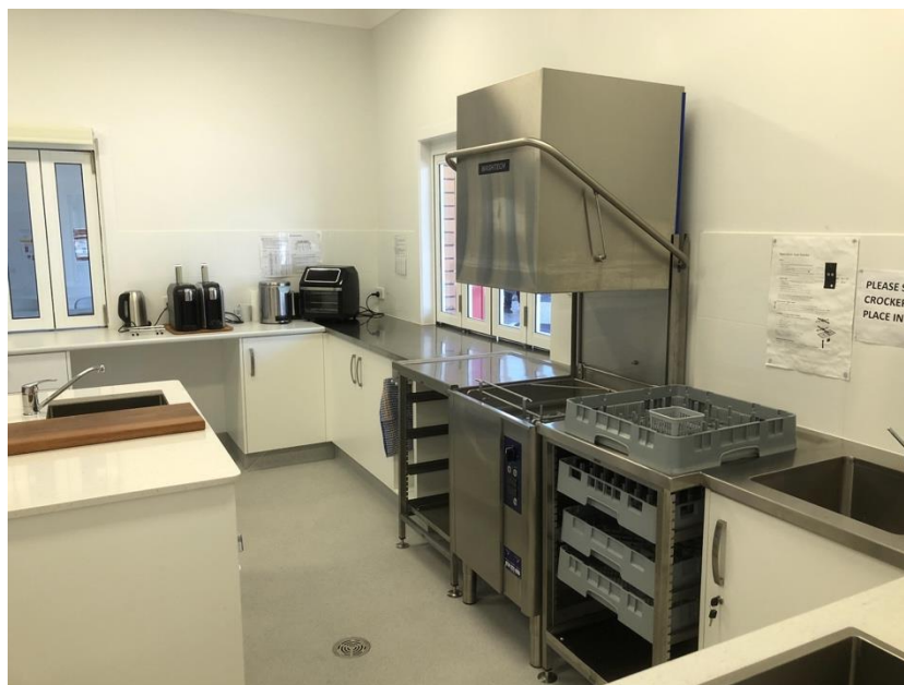
Interior of kitchen

We provide food for the homeless and help with breakfast for children at a local State school.