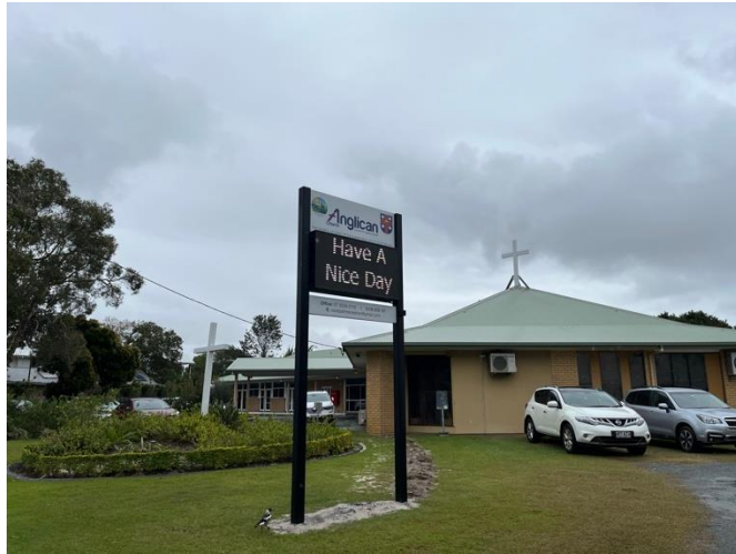
Church complex from Palm Beach Avenue

The church complex includes the main church, an entry lobby and chapel, sacristy, priest's office, parish office, meeting room, fully equipped modern kitchen, and hall. The extensions to the church were completed in 2020.